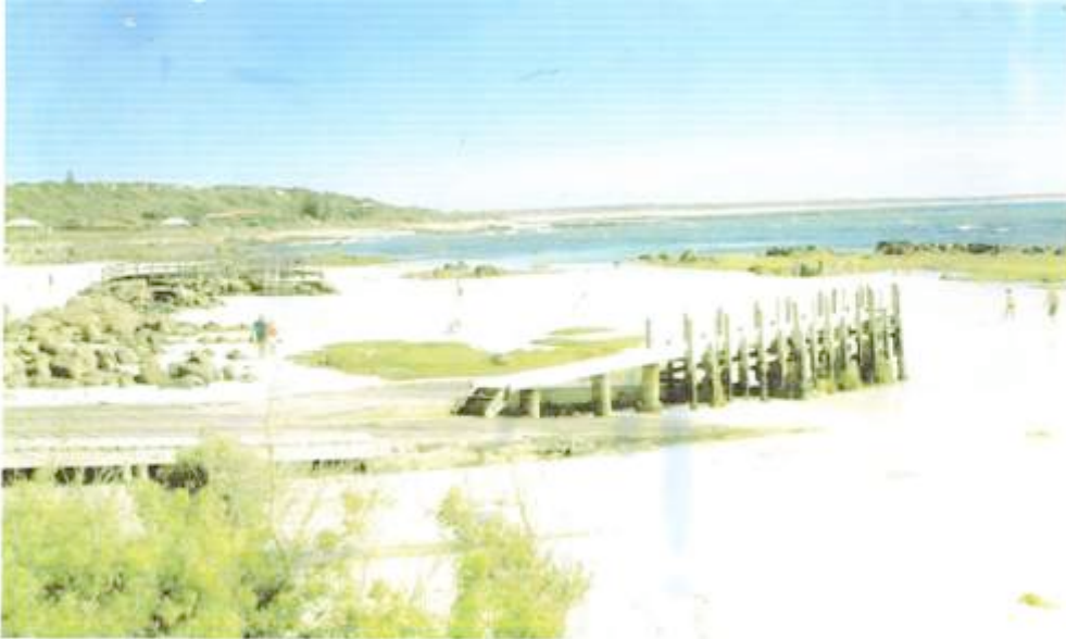
FLINDERS BAY — BOXING DAY 2004